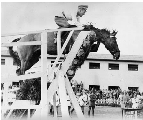
Huaso (Faithful) holds the world record for highest jump set in 1949 in Chile. The Thoroughbred, piloted by Capt. Alberto Larraguibel Morales completed the extreme 8 feet 1.25 inches (2.47 meter) jump on his third attempt. For reference, Olympic-level horses jump obstacles up to up to 5 ft 3 in.