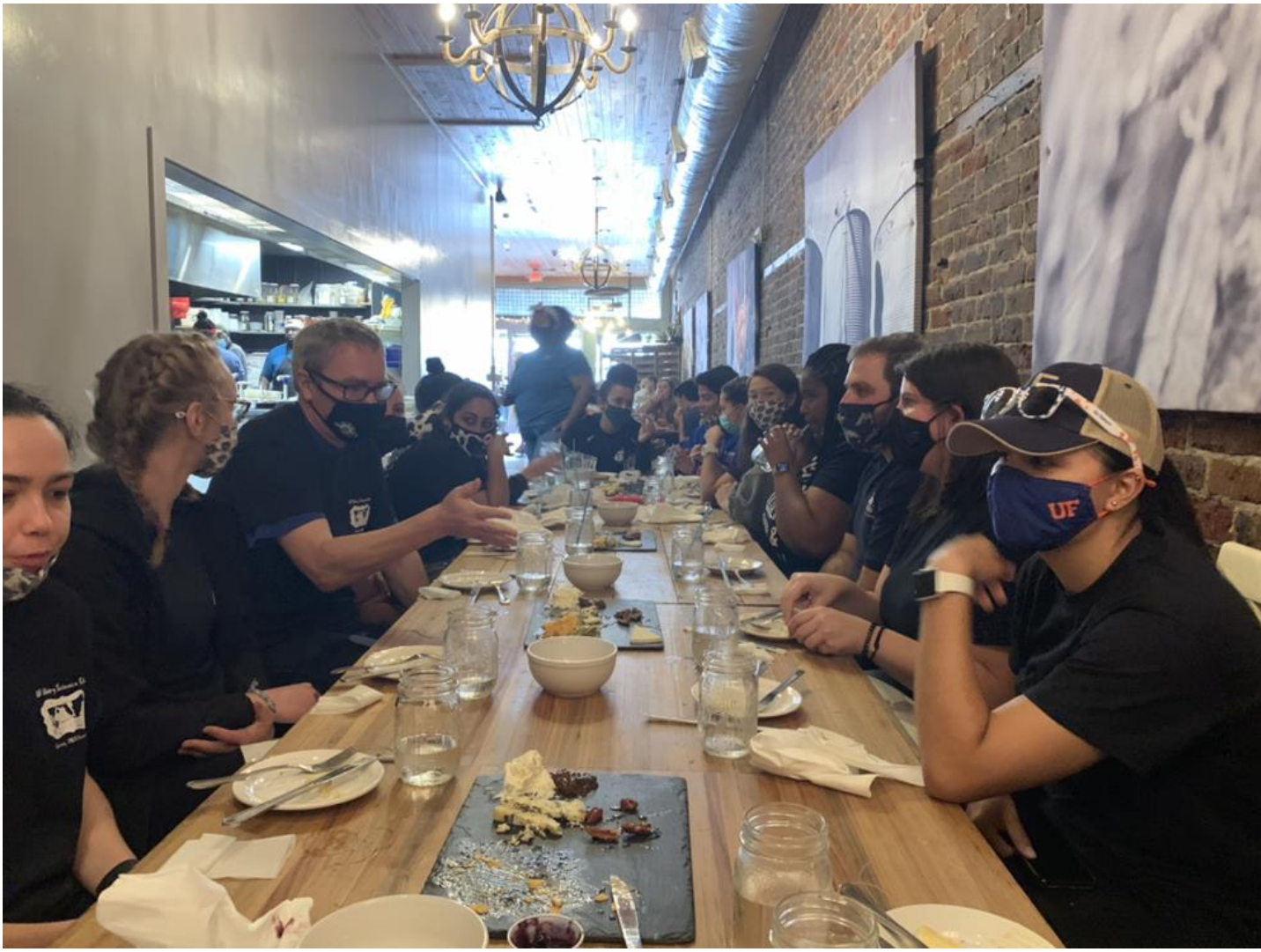
UF Dairy Science Club at the Sweet Grass Dairy Cheese Shop in Thomasville, GA