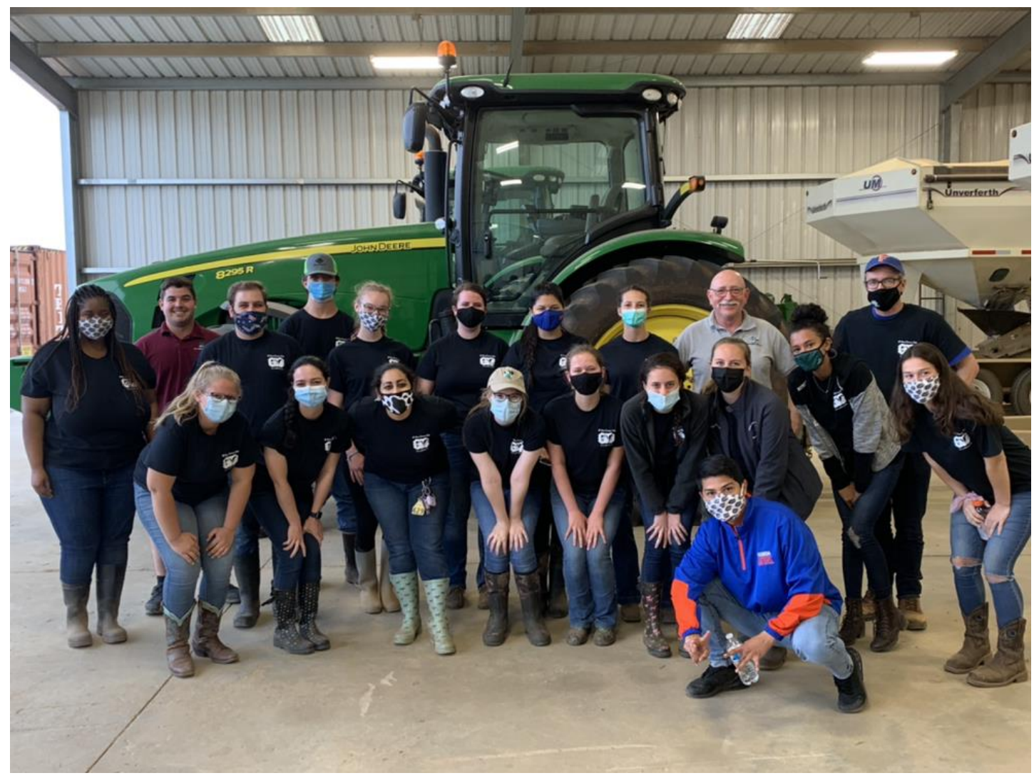
UF Dairy Science Club at Barrington Dairies in Montezuma, GA