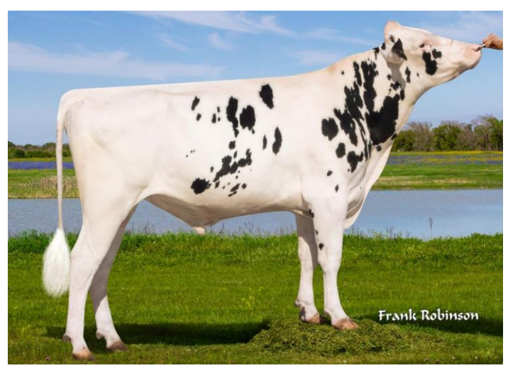
Figure 2. Slick-Gator Blanco (551HO03574).