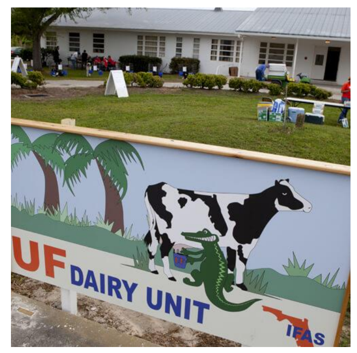
Sign at the UF Dairy Unit