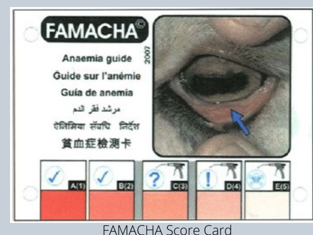
FAMACHA Score Card

FAMACHA IS A SCORING SYSTEM THAT CAN BE UTALIZED AS A TOOL IN DETERMINING BARBER POLE WORM (H. CONTORTUS) PRESSURES IN THE STOMACH OF GOATS AND SHEEP. THE BARBER POLE WORM ATTACHES TO THE ABOMASUM STOMACH WALL AND FEEDS ON THE ANIMALS BLOOD. INCREASED AMOUNTS OF BARBER POLE WORM